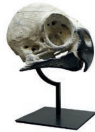
Quentin Garel Perruche ondulée 2015, bronze H 46 x 35 x 25 cm