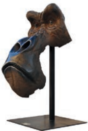
Quentin Garel Masque de gorille bois polychrome H 220 x 110 x 110 cm