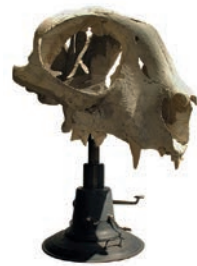
Quentin Garel Félix 2010, bois et céramique H 171 x 144 x 106 cm