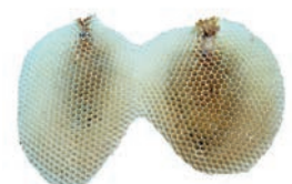
Judi Harvest Seed bank

2017, Glass handmade seeds, flowers and vegetables