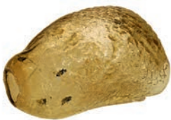
Judi Harvest Alveare d'Oro

2016, Oil paint on wood panel 244 x 244 cm