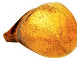
Judi Harvest Fico Scuro

2013, Murano glass and wire 46 x 46 x 86 cm