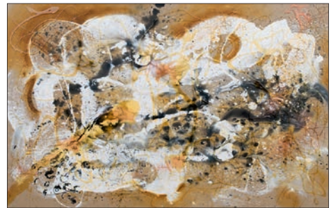
Judi Harvest Swarm

2008, Oil paint, resin and copper dust on linen 147 x 231 cm