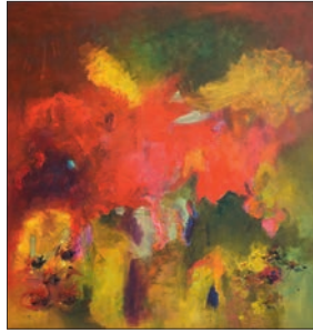
Judi Harvest Honey Garden I