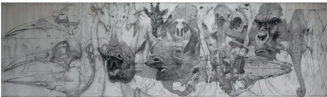
Quentin Garel Palimpseste Fusain et craie sur papier Dessin 1 / 241x328 cm - dessin 2 / 248 x 402 cm - dessin 3 / 246 X 292 cm