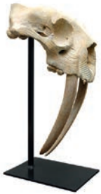
Quentin Garel Tigre à dents de sabre 2013, bronze H 75 x 27 x 40 cm