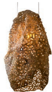
Judi Harvest Monumental Hive

2008, Porcelain, beeswax, gold leaf, resin, collage materials, light & sound 203 x 127 x 81 cm