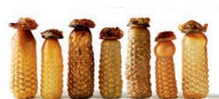
Judi Harvest Honey Vessel - Double Line

2013, Murano glass and wire 91 x 91 x 127 cm