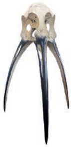
Quentin Garel Monozygote 2017, bois polychrome H 350 x 260 x 250 cm