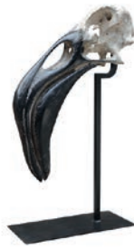
Quentin Garel Phoenicopterus 2013, bois polydrome H 170 x 90 x 40 cm