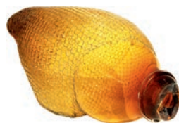
Judi Harvest Gigante

2013, Murano glass, sterling silver mesh 41 x 66 x 41 cm