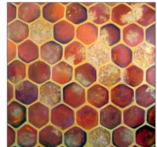
Judi Harvest Honeycomb II diptych

2016, Oil paint on wood panel 244 x 244 cm