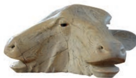
Quentin Garel Bosferatu 2015, bois polychrome H 60 x 110 x 40 cm