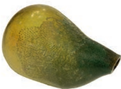
Judi Harvest Alveare Verde

2008, Porcelain, beeswax, gold leaf, resin, collage materials, light & sound 203 x 127 x 81 cm