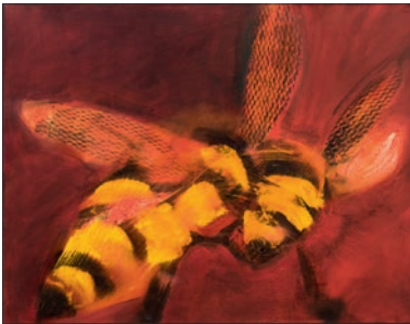
Judi Harvest Red Bee

2008, Oil paint, resin and copper dust on linen 147 x 231 cm