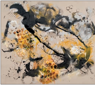
Judi Harvest Nuptial Flight